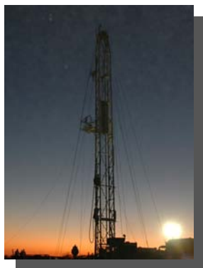
Deepening to the "D"

Maverick is pleased to announce the drilling of fourteen new wells in the Big Foot Field as part of its new and ongoing drilling operations. According to CEO James McCabe, "Maverick's Big Foot Field operations have increased production volumes by over 25% for the first two quarters, with current daily production at over 400 BOE. This volume is down due to adverse weather conditions, and is expected to rise steadily with our continued drilling programs now in progress."